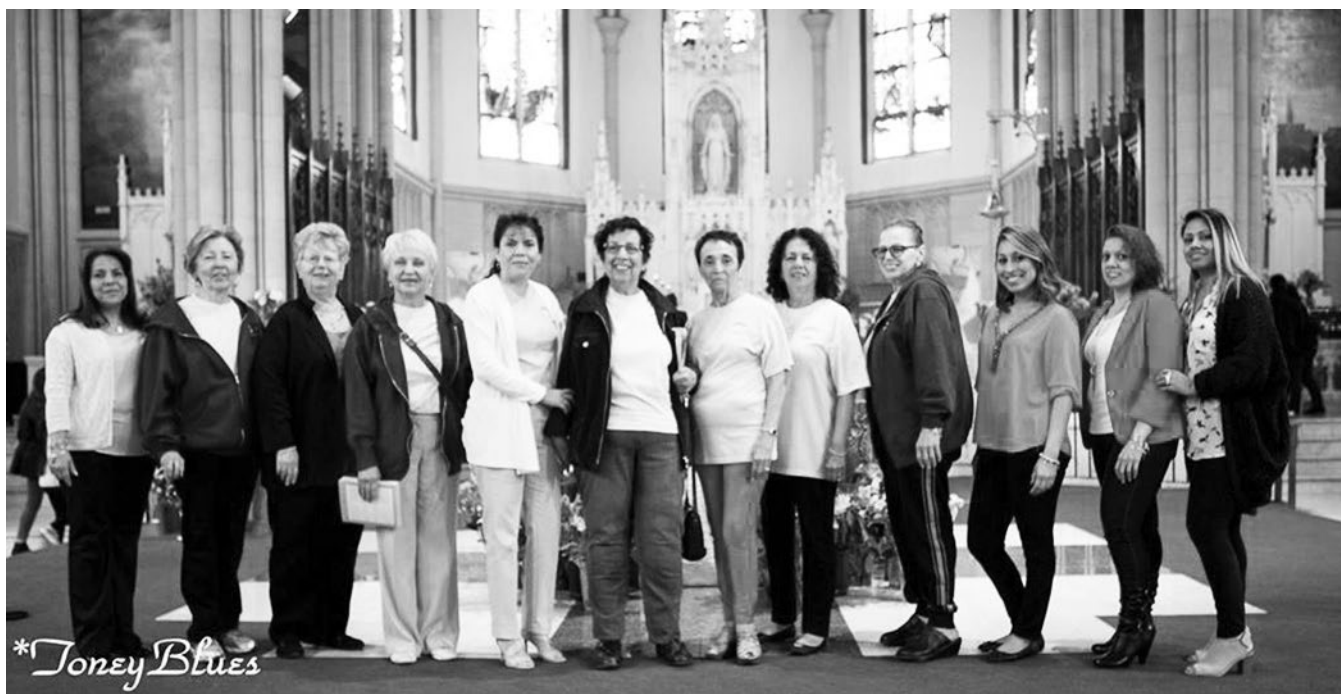
The Women of Hope were installed at the 9:30 AM Mass on Sunday, May 22nd. May God bless them as they continue the great work and contribution they provide to SMGH Parish.

St. Mary Gate of Heaven Church The Children's Hour Pre-School for children age 2 1/2 to 4 Full Day Monday - Wednesday - Friday For an appointment please call 718 846-3773